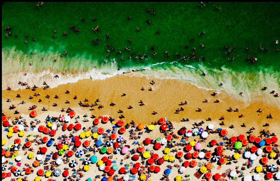
TONY KELLY Rio Aerial