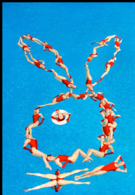
TONY KELLY Water Beauties